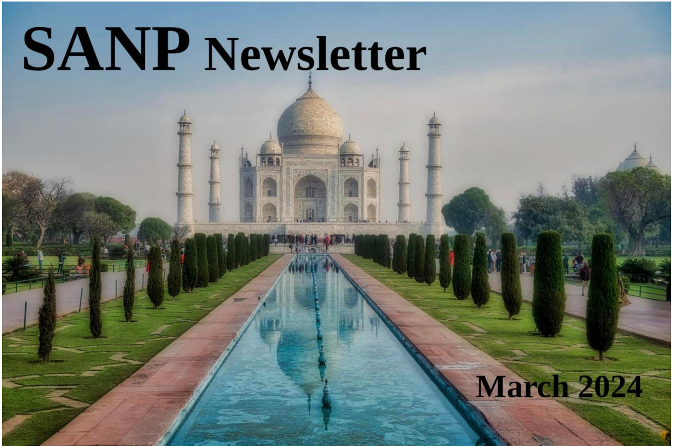
Taj Mahal.