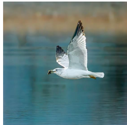
Seagull at the Cove, Concord Park.

Any club member can facilitate a Focus Session. You should have some knowledge of the subject but do not need to be an expert. Attendees may have more knowledge than the leader. The objective of each session should be the interactive sharing of knowledge by the leader and attendees. A focus session might be coordinated with a Field Event on the same subject for hands-on application of shared knowledge.