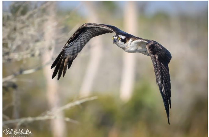
Above: Osprey circling before diving for a meal.

Nye Simmons still has space available on the spring Smokies workshop April 22-25 and the Blue Ridge Parkway May 2-5. Fall workshops in the Smokies Oct 24-27 as well as two kayak based workshops at Caddo Lake November 7-12 and Louisiana Swamp Fall Color December 2-7 are also still open. For more information visit www.nyesimmons.com .