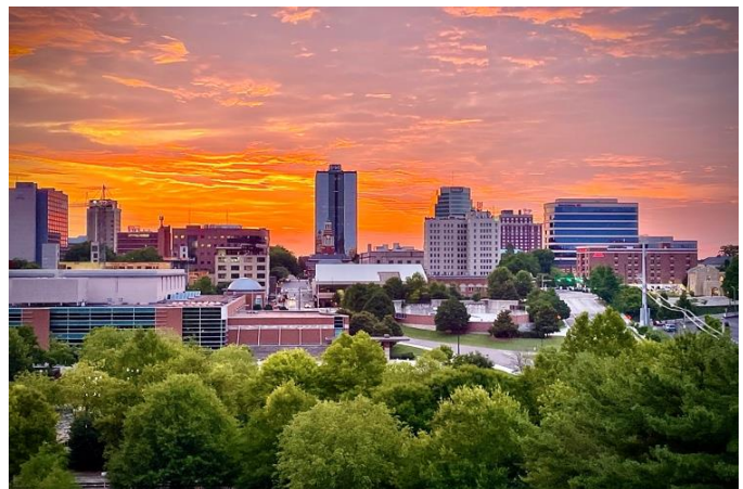
Sunrise over Downtown Knoxville