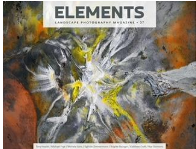
Elements, March 2024

Want to subscribe to ELEMENTS? Use the discount code NYE10 for a 10% discount. https://www.elementsphotomag.com/