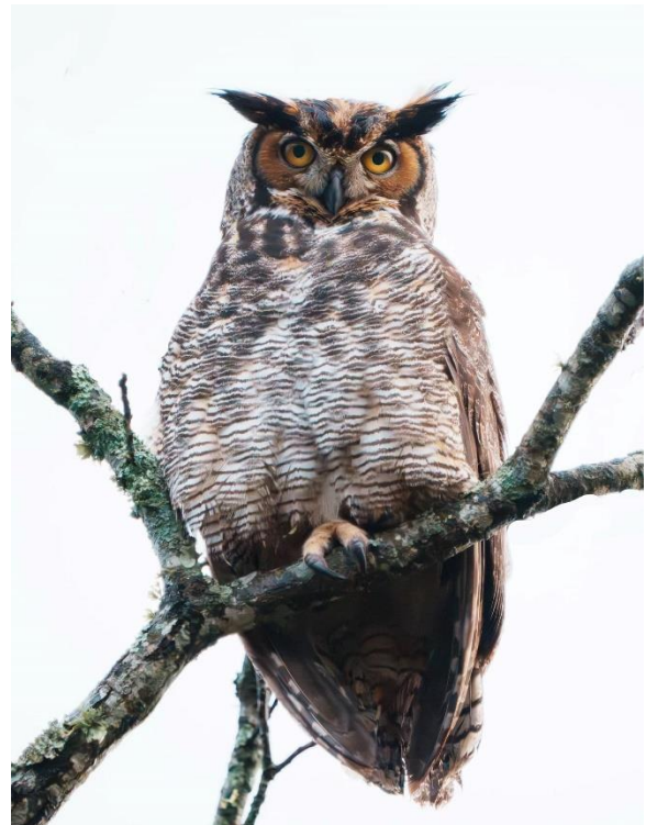
Below: Great Horned Owl.