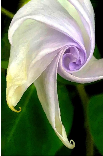
Jimson Weed. 2 nd Place, Plants category, 2023 Print Image Salon.

Salon changes are happening. The fall salon will be approaching soon. Start planning for images you want to submit in a digital or print format. The SANP Board recently approved a change for this year's salon. Beginning this fall, ribbons for 1 st , 2 nd , 3 rd , and Honorable Mention will be awarded for every category in print and digital. Those that win Best of Show in print and digital, will be awarded a Best of Show ribbon in addition to their first-place ribbon.