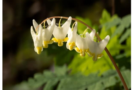
Dutchman's Breeches. From the Norris River Bluff Field Event

A field event is a free event without any photography instruction. It is an event where you can hang out with other photographers, but you may or may not accomplish the intended goal of the field event. While field events are popular due to the price, the workshops planned for this year should be worth the fee.