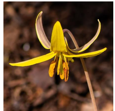
All images © Janine Johnson