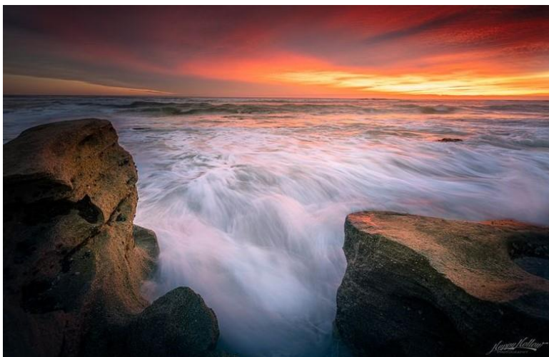
Top right: Double Trouble. © Joe Rentz