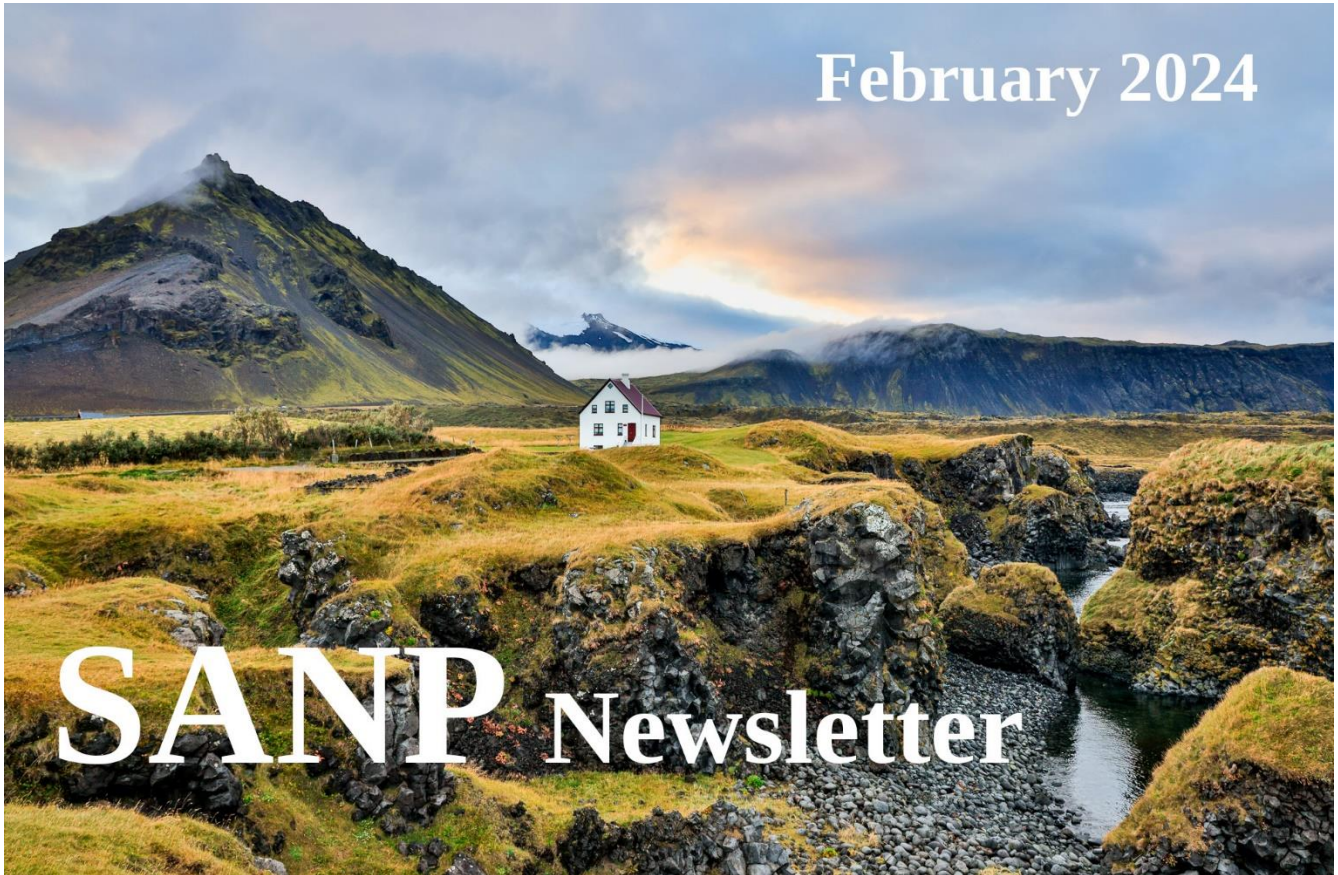
Lonely Home. 2 nd place, Travel & Place 2 category, 2023 Print Salon.