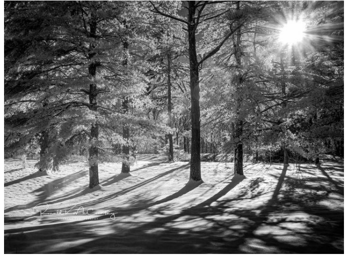
Top left: Sunrise at Port Klang, Strait of Malacca, Malaysia. Top right: Black & White Infrared of the Snow. Bottom left: Robin. Bottom right: Yellowstone fox.