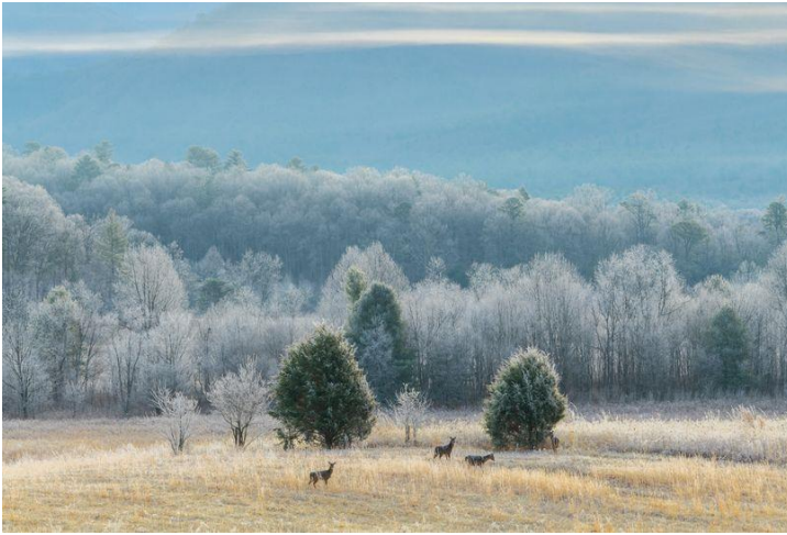
Left: 3 rd Place (tie), © Bill Lea Below: 3 rd Place (tie), © Kent Sauter