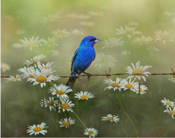
Above: Hello, Summer. Best in Show, 1 st Place Birds category. 2023 Print Image Salon. © Theresa Williams