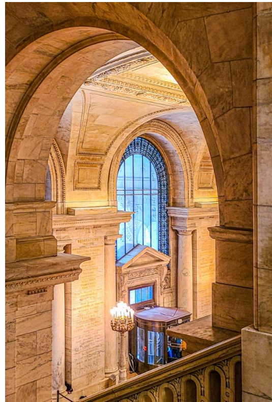
Golden Arches. 3 rd place, Travel & Place 1 category. 2023 Print Image Salon.