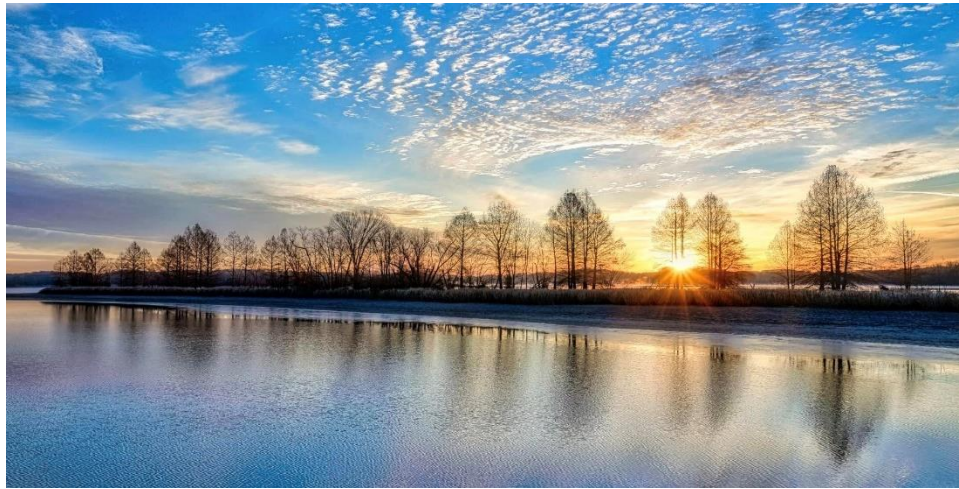
Top Center: Blythe Ferry Sunrise.