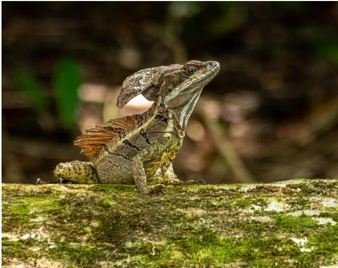
Common Basilisk Costa Rica. 3 rd Place, Wildlife - Other category. 2023 Print Image Salon.

If you have online resources for photo editing that you've found particularly helpful, let us know. Newsletter editor