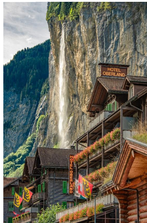
Alpine Colors. Honorable Mention, Travel & Place 2 category. 2023 Print Image Salon.