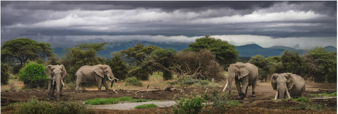
Four Old Friends at the Waterhole. 1 st place, Wildlife – Mammals category, 2023 Print Image Salon.

The February Photo Challenge is underway. The objective is to photograph winter in East Tennessee. When Ron McConathy chose the topic, I doubt he knew what a winter we would have this month. If you haven't registered for the challenge, it's not too late! Read more on the website: February Photography Challenge