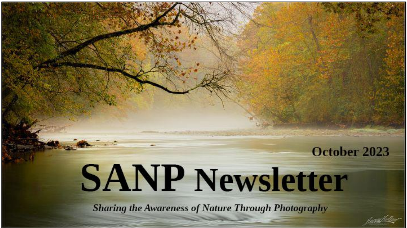
Foggy and Rainy Afternoon along the Clinch River.