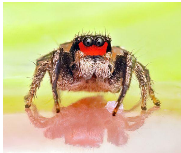
Red-faced Jumping Spider