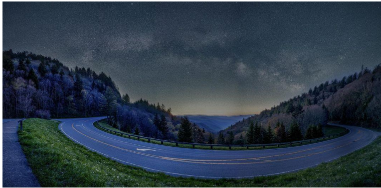
Milky Way over the Oconaluftee Valley.

A few days remain to capture Michel d'Oultremont inspired images for the November Photography Challenge. The Challenge description and instructions are posted on the SANP website at https://sanp.net/event-5381644 . The images must be submitted from October 29 thru November 4, 2023. Winners will be announced in the next newsletter.