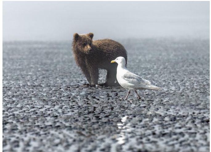
Not Sure in Old Tyonek, Alaska

Joining or renewing your SANP Membership is easy. Visit the website and renew your membership today. Bring a friend with you! Join SANP