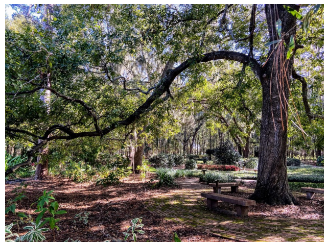
Sholom Park in Ocala Florida