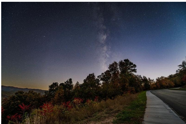
Foothills Parkway Milky Way