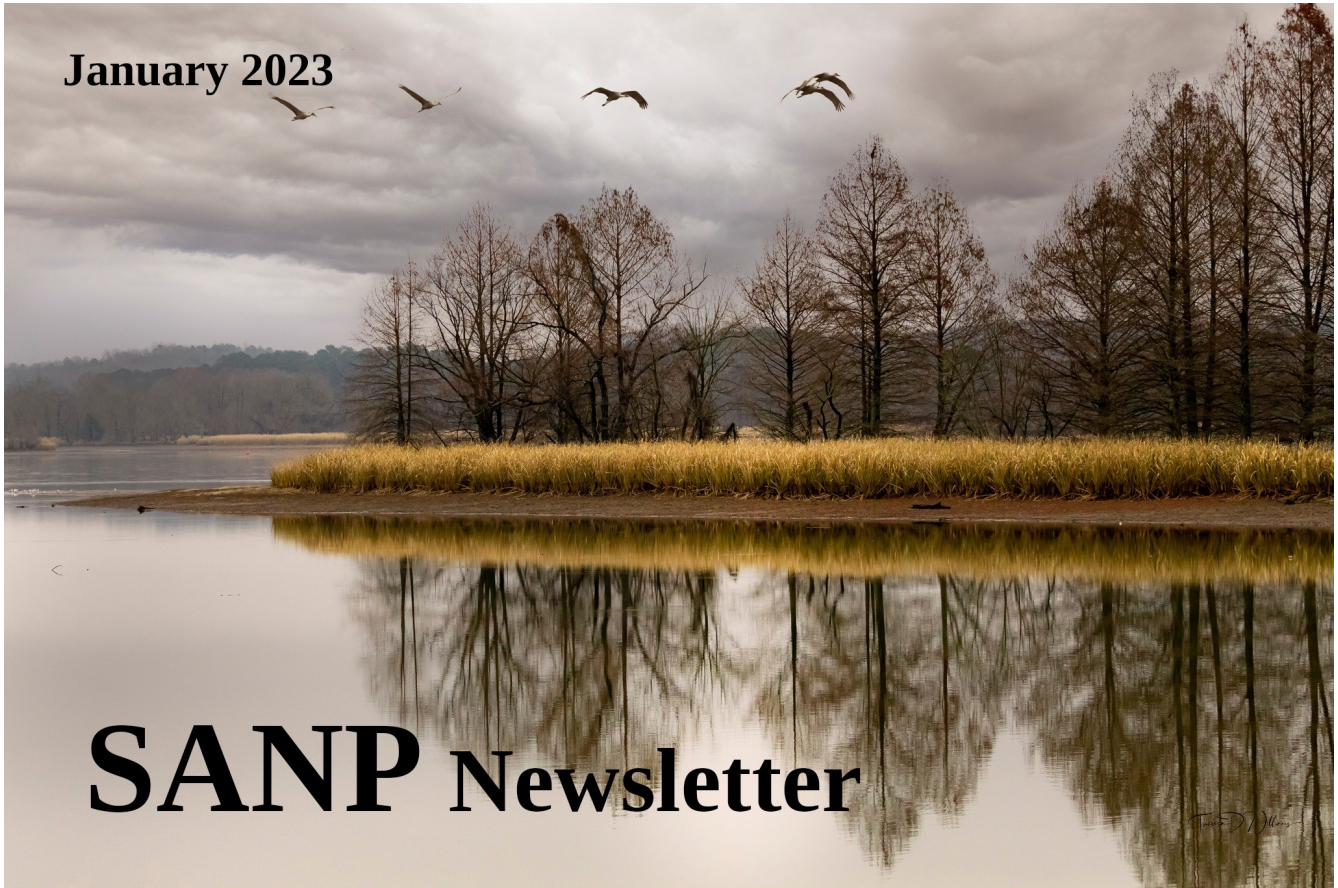
Blythe Ferry