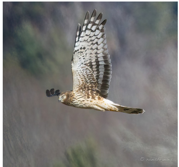
Northern Harrier in Cades Cove

See page 2 for more information about the Salon and reserving your place for dinner.