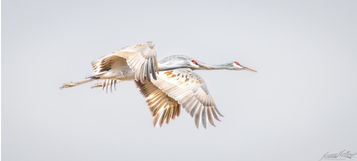
Sandhill Cranes