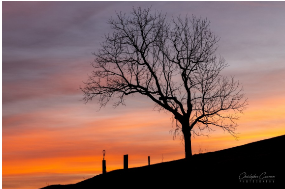
Change of Plans, © Chris Cannon