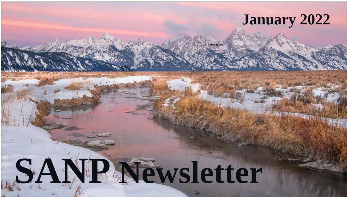
Tetons Sunrise, Scenic Category, 3rd place, 2021 Salon