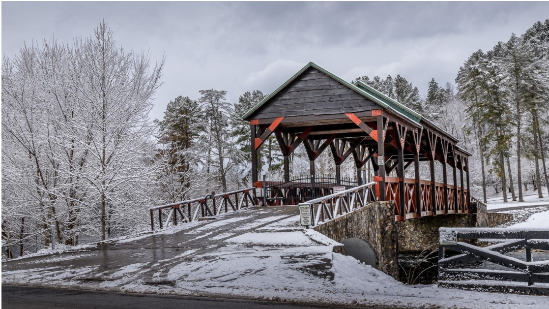
Tellico Plains Covered Bridge, Travel category, 2021 Salon