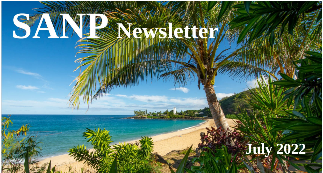
North Shore, Oahu, 3rd place, Travel and Place 2 category, 2022 Digital Image Salon