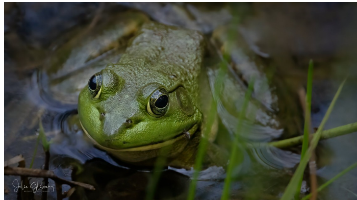
Top left: Sunflower, Bottom left: Sunflower in bud, Above right: Frog at Seven Islands

SANP field events are posted on the website events page. Email announcements are sent to all club members. Those who register for an event will receive email updates and reminders. Occasionally changes need to be made to scheduled events. It's a good idea to check the website often to be sure you know the latest information. Events are often scheduled on short notice, so check the website to be sure you don't miss out. If you are not receiving event emails, please let us know by emailing mailto:sanpinfo@sanp.net