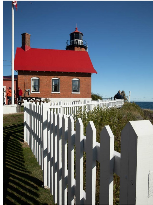
Eagle Harbor Lighthouse on Lake Superior, Travel & Place 2 category, 2022 Digital Image Salon