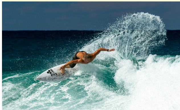
Pupukea, North Shore Oahu, 1st place, People in Nature category, 2022 Digital Image Salon

More details on the event, including submission guidelines, can be found on PPETN's Facebook page.