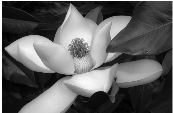
Magnolia, Honorable Mention, Black and White - Other Category, 2022 Digital Image Salon

We are looking for brief travel reports of places, near or far, members have recently visited for upcoming newsletters. Interested? All you have to do is write a paragraph or two about the location, include a few captioned photos that represent your experience, and submit them to the newsletter editor. ( Kristina Plaas ) We get our best ideas from sharing with each other. Let's see where you've been!