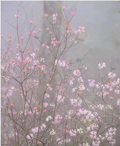
Top left: Pinkshell azaleas in fog

Summer is here and the cameras have come out to play. These are a few of the images shared by club members on the SANP Facebook page. Do you have images you'd like to share in the newsletter? Please email the newsletter editor and let me know. We want to see where you've been and what you've been photographing. Have a great summer!