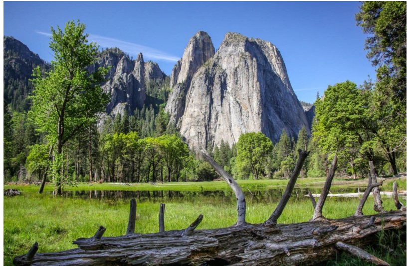
Cathedral Rocks in Yosemite NP, Landscape Category, 2022 Digital Image Salon

Hi there, I'm putting together a rough draft of the SANP history, along with an events timeline for the club. If you have any stories, images, or personal histories about you or other members to include that would make the history more interesting to read, I would love to include them. Nothing is too small to include, even a sentence or two.