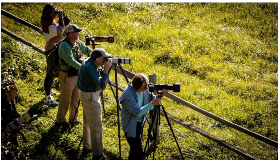
Photographers in their Element, People in Nature category, 2022 Digital Image Salon, © Ann Barber

Note you can be specific or general in your answers.