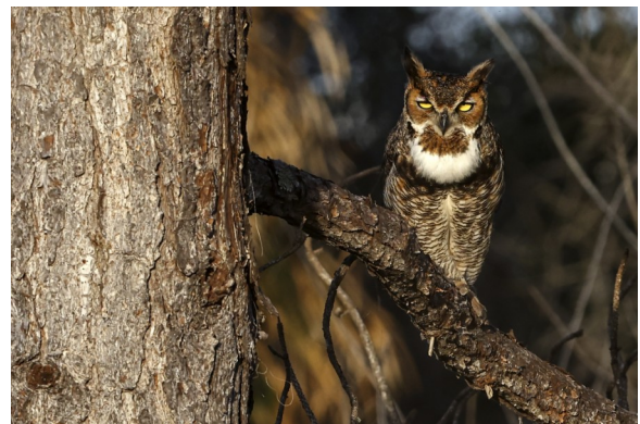
Great horned owl, © Wade Payne