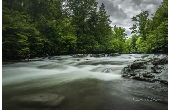
Middle Prong Little Pigeon River at Greenbrier

The Memorial Day holiday weekend proved to be a great time for SANP members and friends to meet and create a few photos. Field events were held in Cades Cove, the Greenbrier area of Great Smoky Mountains National Park, and the TVA Wetlands.