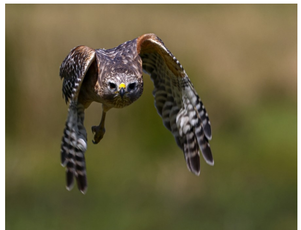
Above left: Belted kingfisher. female Center right: Barred owl Bottom right: Red-shouldered hawk