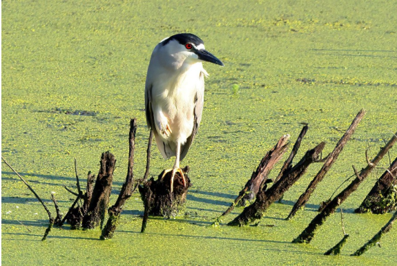
Black-crowned Night-heron, TVA Wetlands