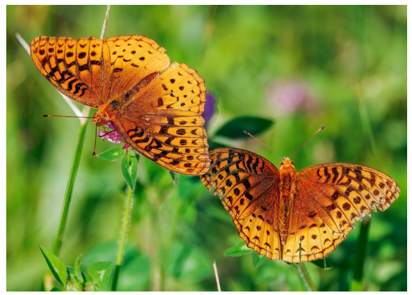
Great spangled fritillary, Cades Cove

The next field event is this Saturday, June 25, at Carvers Gap in the Roan Highlands. Read more about the event and register on the SANP website: Carvers Gap