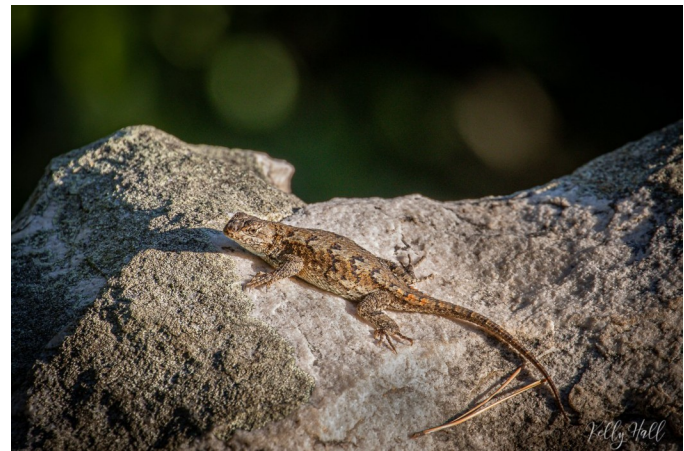
Center right: Eastern fence lizard