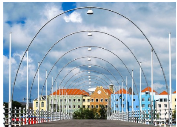
Gateway to Curacao.