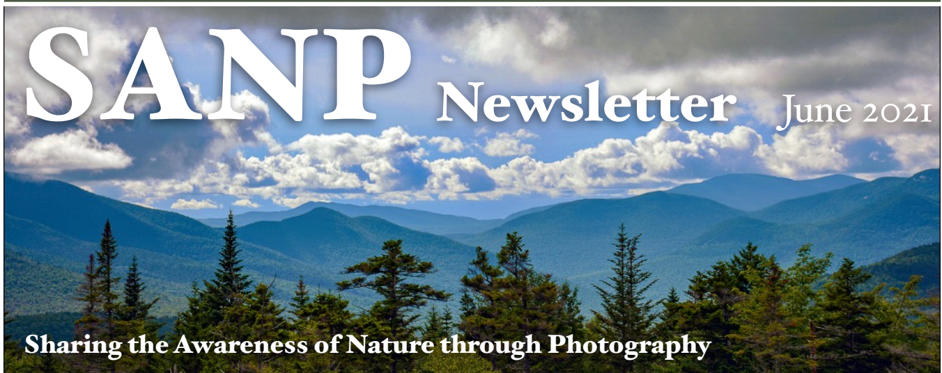
White Mountains, Panoramas category, 2021 Salon, copyright Bobbie Thurston.