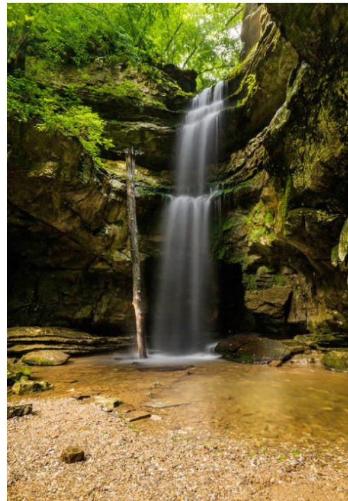
Lost Creek Falls, ISO64, two images, 8 and 15 second exposures, f22, focal length 20mm, with a circular polarizer; one exposure for the water and the other for the background.