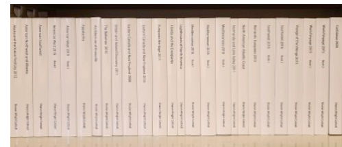
The 24 books documenting my travels, created with Lightroom and Blurb.