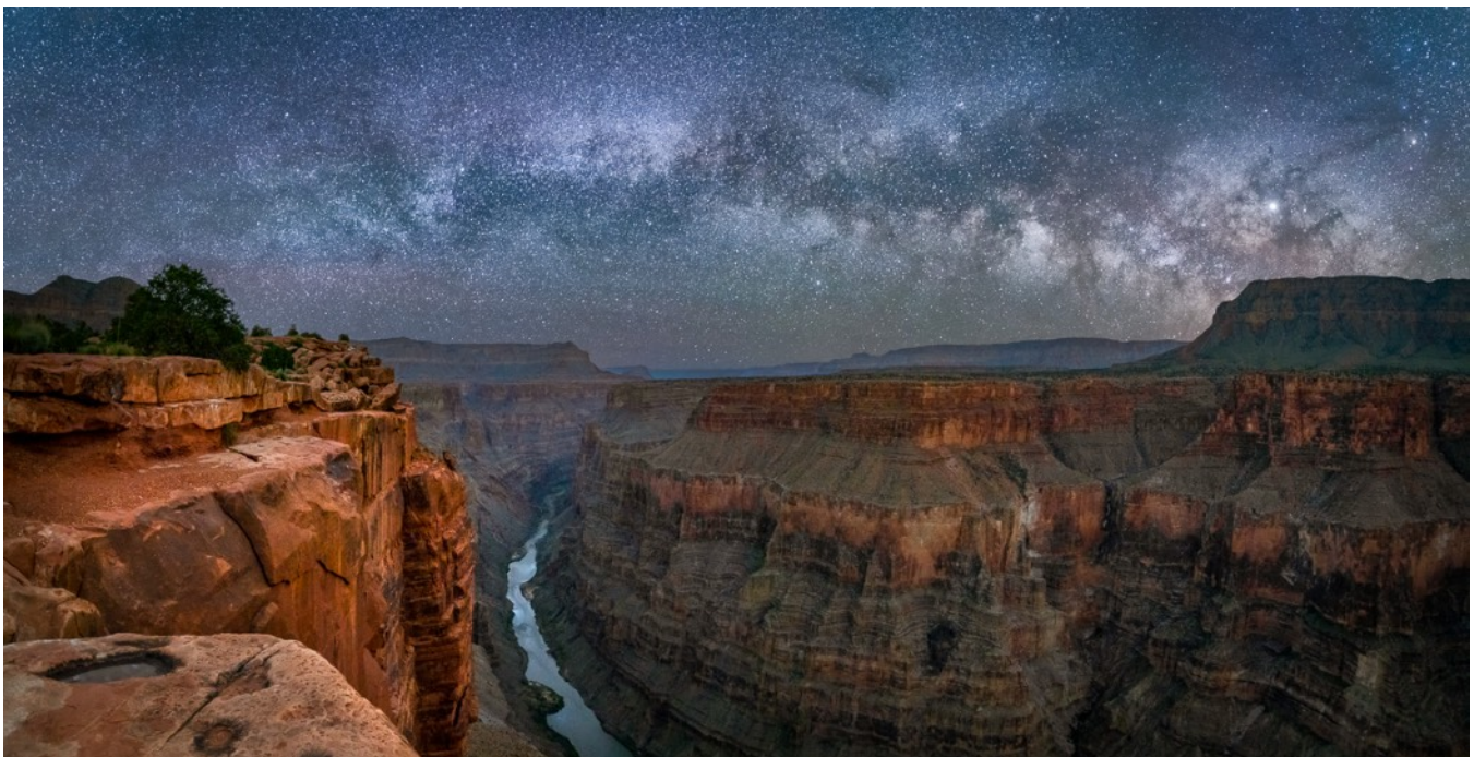
The Milky Way from Toroweap, Grand Canyon.