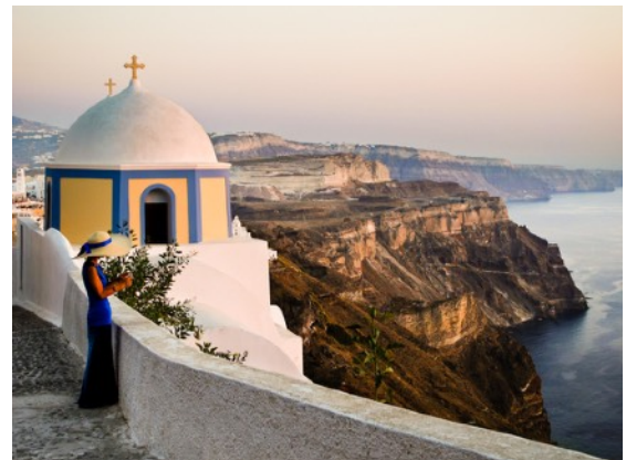
Fira Village Santorini.