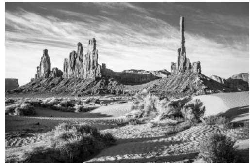
Totem Pole and Yei Bi Chei in Monument Valley, AZ.