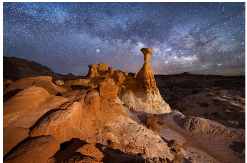
Milky Way over the Toadstools near Kanab, Utah.

SANP club members do not need to register. The Zoom link will be emailed to you on Sunday, June 27. Guests who are not SANP club members must register to receive the Zoom link via email. On June 29, visiting time starts at 6:45 and the meeting at 7.