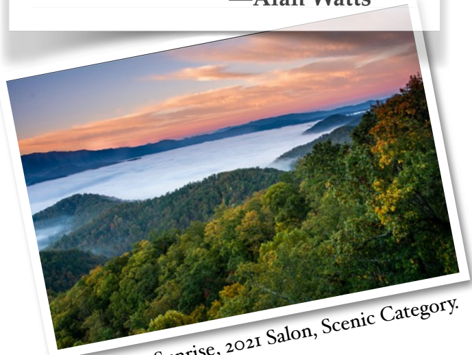
Foothills Sunrise, 2021 Salon, Scenic Category.