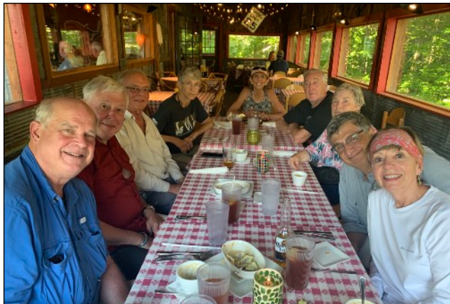
SANP group about to enjoy a meal at Foglight Foodhouse.