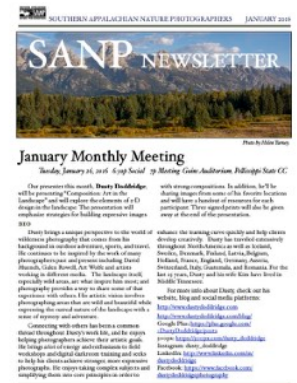
January 2016 issue of the SANP Newsletter, the first one with our current format.