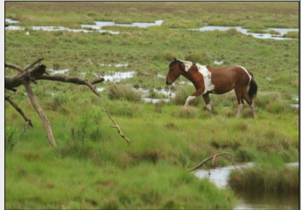
Chincoteague pony.

Brad Cottrell: This is the best photo I got of the ponies during our visit to Chincoteague National Wildlife Refuge, located on Assateague Island in Virginia, in late May. The ponies are difficult to approach. This image was shot with a 448-mm equivalent focal length and then cropped to about 60% of original image size.