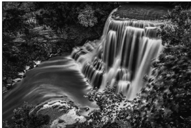
Burgess Falls.