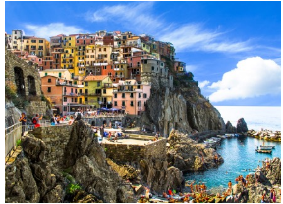
Cinque Terre Italy.