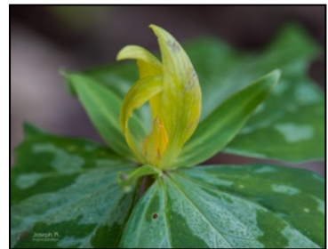
Spring wildflowers.