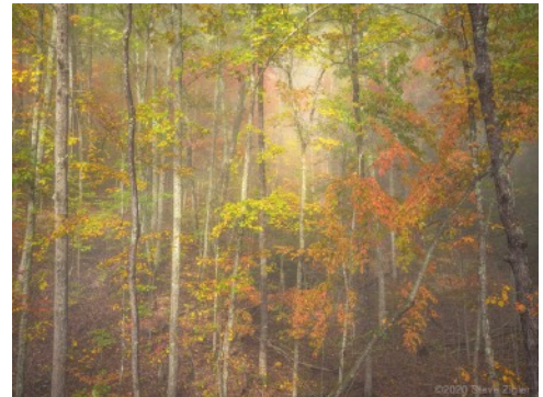
Lost in the Light.