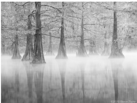
Sound of Silence.