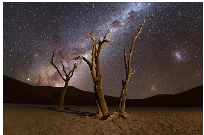
Where You Can See Forever.