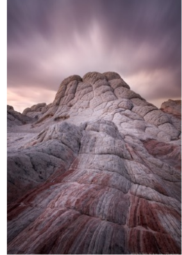
Storm Before the Calm.