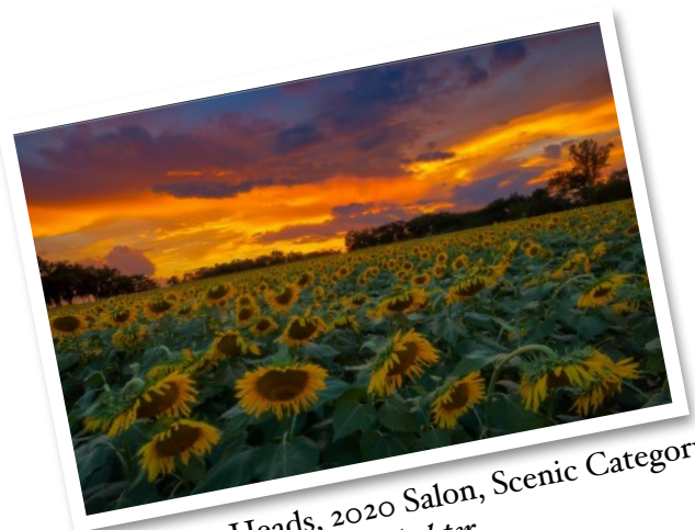
Golden Heads, 2020 Salon, Scenic Category, copyright Braam Oberholster.

Check out their website at www.3ct.org ; past newsletters can be found under the “Resources” link at the top of the home page or behind the “Menu” button. You can also visit their Facebook page at www.facebook.com/CameraClubCouncilOfTennessee .